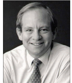
Steve Rattner, Car Czar

Obama's takeover of the American auto industry is so breathtaking in scope and power that it proves all the RNC's accusations about Socialism. The takeover was followed by orders to close 789 local Chrysler dealers, notices to 1,100 General Motors franchises that they will be shut down by next year, and estimates that total dealer shutdowns will rise to 3,000.